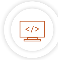
Coding and documentation

From coding to compliance, a hospital's revenue cycle and financial success depends on charge description master accuracy and completeness.